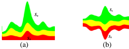
Figure 2. Visualization with ground-based (a) and symmetric (b) graph geometry

We define density function \rho_i as the distribution of the number of tweets belonging to sentiment class i . Let the bottom curve function of the visualization graph be S_0 . Thus, the upper boundary of the layer of the sentiment class i is S_i = S_0 + \sum_{j=1}^i \rho_j .